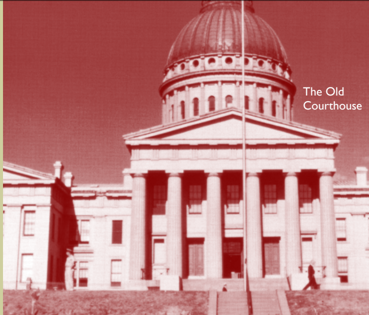
The Old Courthouse